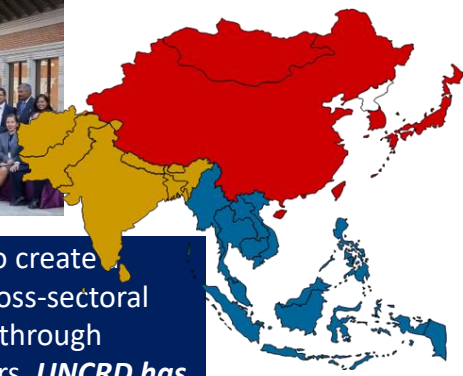
24 EST Member Countries