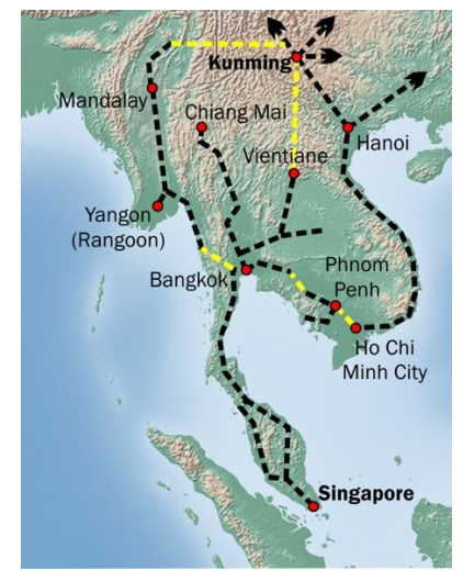
Figure 2 Kunming - Singapore Rail Plan. Used under License. 65