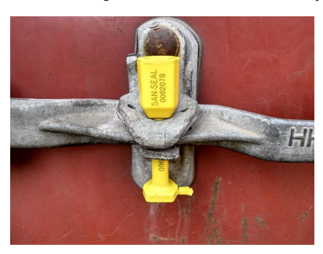
Figure 1 Customs seal on a freight container. Seals registered at border crossings by trusted shippers should allow freight to cross borders seamlessly.<sup>13</sup>