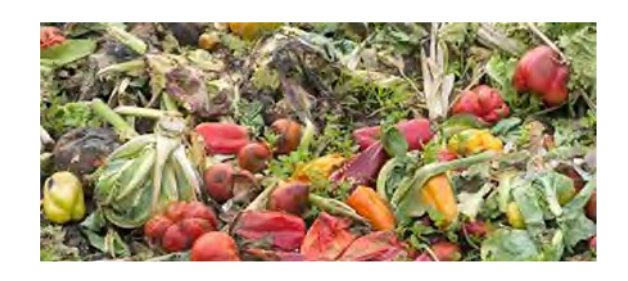
Upscaling Organic Waste