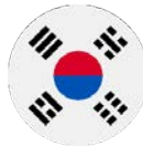
Rep. of Korea