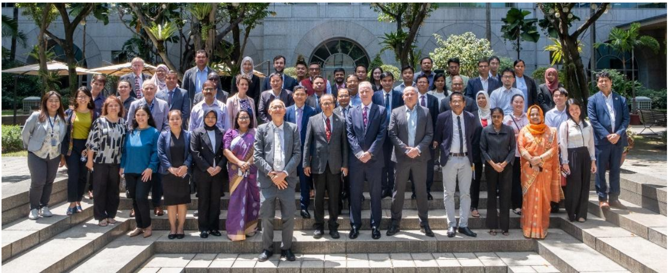
Participants of the Regional Capacity-Building Workshop, ADB Headquarters Manila

International Transport Policy Support Activities in EST Forum Participating Countries: Scope and Alignment with the Aichi 2030 Declaration. UNCRD commissioned a mapping of the thematic and geographic scope of policy and capacity-building support activities carried out by international organizations and their alignment with the Goals and Strategies of the Aichi 2030 Declaration. The report and its findings support the planning of future policy support and will help enable the EST Forum participating countries to achieve the Aichi 2030 Declaration.