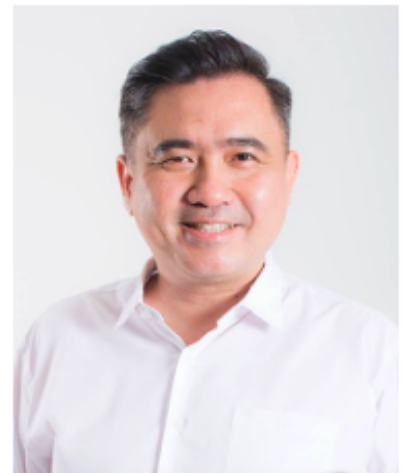
H.E. Loke Siew Fook, Minister Ministry of Transport the Government of Malaysia

On behalf of the Government of Malaysia, I am very pleased to invite you to the High-Level 15th Regional Environmentally Sustainable Transport (EST) Forum in Asia, which will take place on 24-26 October 2023 in Kuala Lumpur, Malaysia. Under the theme of “Investing in Sustainable Transport, Heartbeat To Sustainable Economic and Social Development in the SDG Era” the Forum will focus on the benefits of developing a sustainable transport infrastructure.