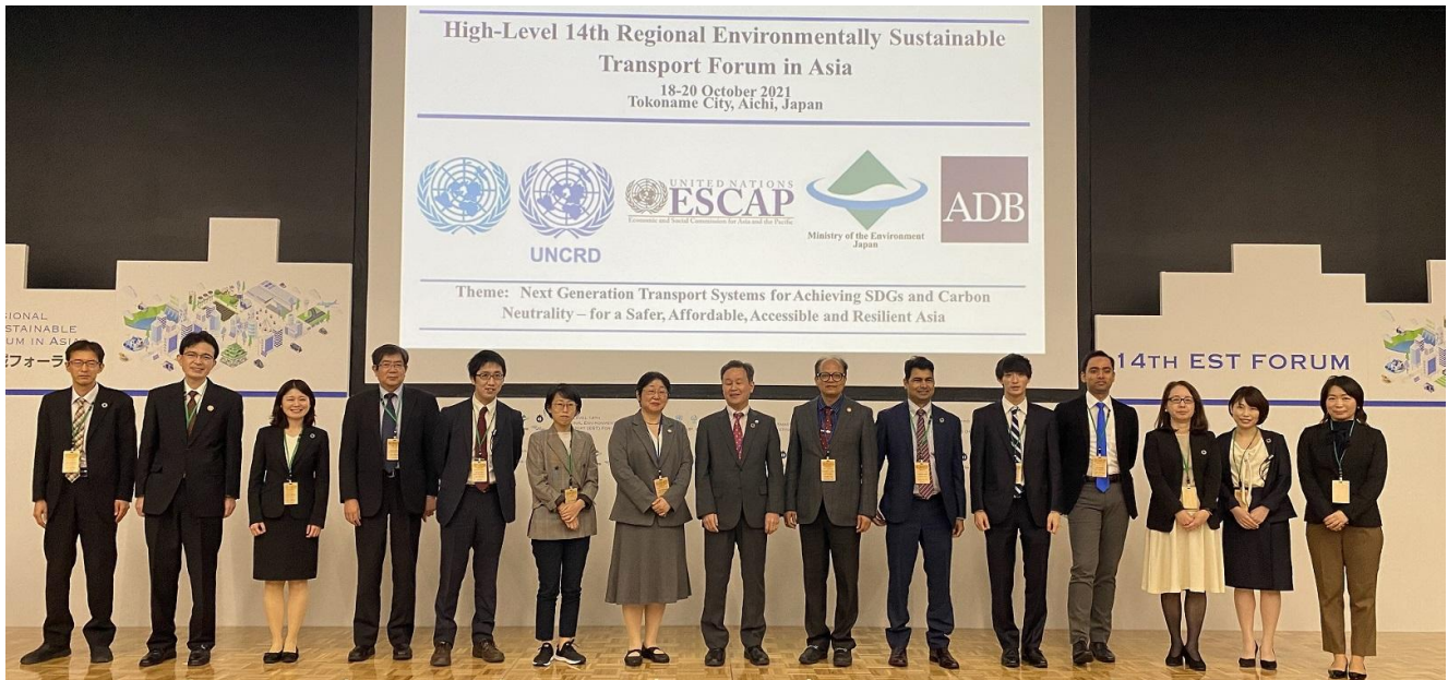
Adoption ceremony of the Aichi 2030 Declaration