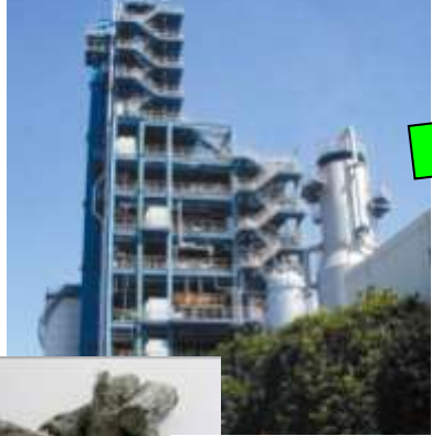
Plastic Chemical Recycling Plant (Showa Denko Inc.)