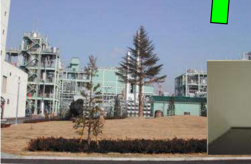
PET to PET Recycling Plant (PET Refine Technology Inc.)