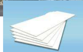
Kawasaki Zero Emission Industrial Park