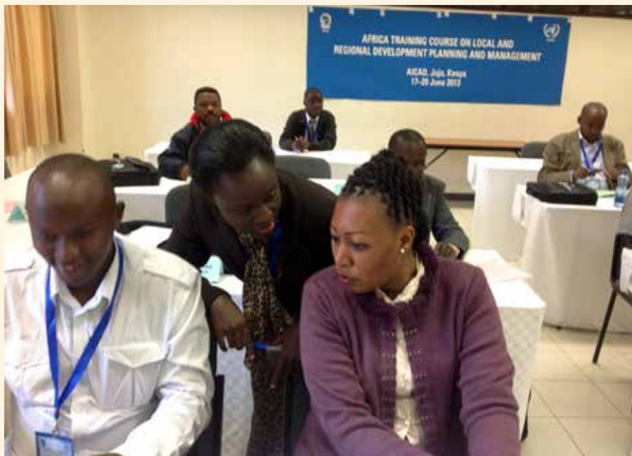
Group presentation session

To expose participants to practical experience in analyzing real-life situations, a field study to Del Monte Kenya Limited was organized. This offered the participants a hands-on opportunity to collect data and information on the project; evaluate it and prepare reports on their findings and suggest proposals for its improvement. The process was quite exciting to the course participants.