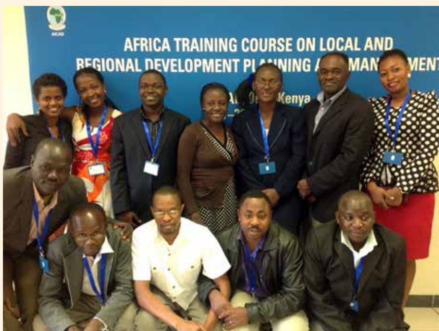
Some of the ATC participants with UNCRD and AICAD staff

Beyond meeting their expectations, the course also explored ways and means of solving Africa's regional development challenges. Participants noted that both the course content and the training materials were very well tailored to local and regional development planning and management and were presented by very knowledgeable resource persons. The participants rated the course as practical and applicable to their day-to-day work. Project planning, management and evaluation and research design, data collection and analysis were singled out as the most practical modules, while Re-entry planning and TOT techniques provided a unique opportunity to share knowledge gained during the training. However, the evaluation highlighted that the two weeks allocated to the course were not enough, considering its intensity. Group activities and discussions were highly appreciated as a means of understanding, internalizing and providing feedback on the lectures and sharing country experiences. □