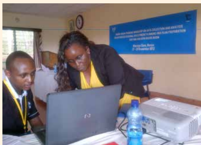
Consultation among TARDA staff

In order to effectively carry out its mandate, TARDA undertakes the following functions: (1) advises the Government of Kenya and the various line ministries on all matters affecting development of Tana and Athi Rivers basin; (2) co-ordination and monitoring of development programmes and projects; (3) liaising with the government, the private sector and international development agencies to support development efforts in the basin; (4) assisting institutions operating in the region to access credit and funds to finance their programmes and projects; and (5) preparing short and long-term development plans for the region as well as updating the plans from time to time.