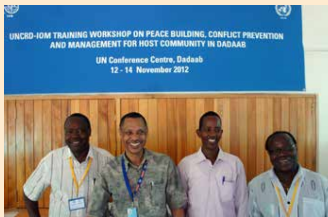
Some of the resource persons