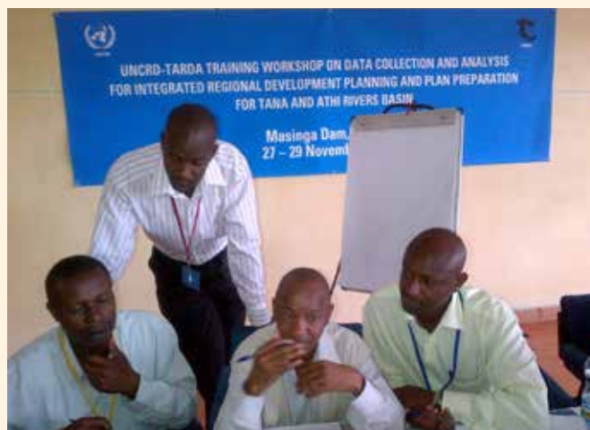
Group exercise session

The region covered by the basin is important in Kenya's natural resource management and economic development. The two rivers form a hydrological system with the largest water resources in the country. In the 1960s, these water resources attracted massive investments in hydroelectric power generation.