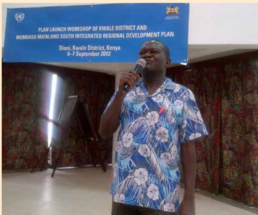
During the Plan launch workshop

The plan is a long-term development document that addresses the socio-economic and environmental problems of the region with the objective of improving the standard of living of the people through employment creation, reduction of poverty and creation of wealth. In this regard, the plan provides comprehensive strategies and policy guidelines to solve the problem of rural and urban development, including agriculture, mining and industry, infrastructure and human settlement, eco-tourism, and sustainable environmental management.