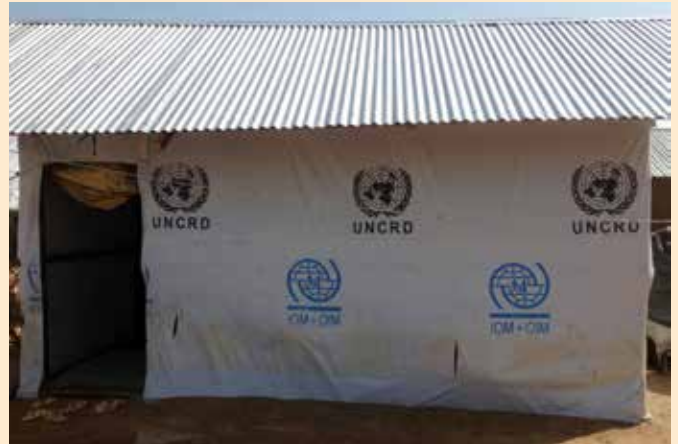
Shelter built by UNCRD, in collaboration with IOM, for the refugees

Shelter Improvement: In partnership with the International Organization for Migration (IOM), UNCRD has constructed 320 emergency transitional shelters and trained 110 members of the refugee and host communities in shelter production. This has provided short-term employment to approximately 100 members of the host and refugee communities, as well as business opportunities to local suppliers and contractors, contributing significantly to the economic wellbeing of the Dadaab area. In partnership with UNHCR,