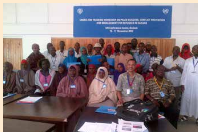
Some of the resource persons and participants

Capacity building initiatives have been at the core of the Somali Refugees Project. UNCRD Africa Office has organized and undertaken several capacity building workshops for both refugees and the host community members. The trainings were organized concurrently with other activities that support alternative livelihood. Key among the capacity building activities includes: