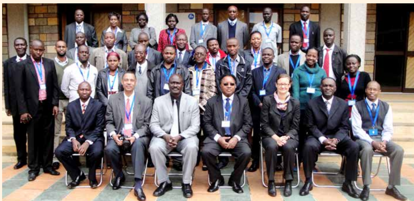
Group photo during the opening ceremony of ATC

To link government policy and peoples' needs through project identification, and implementation, participants were taken through project planning, management and evaluation. The importance of research design in the planning process as well as the techniques of data collection and analysis, including the use of computers in data processing, storage and presentation, was also included in the course module.