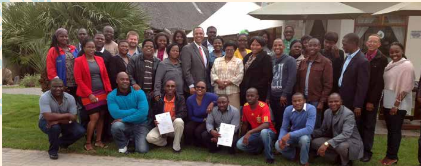
Participants of the Namibia training workshop