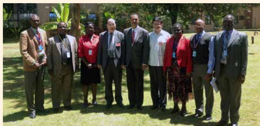
Group photo with Mr. Wu Hongbo