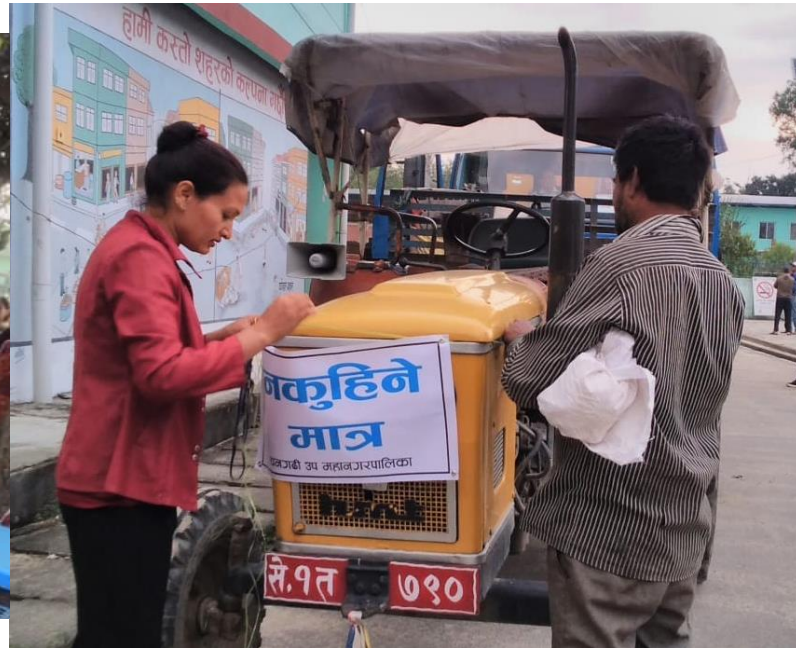
A glimpse of the city's effort toward waste management.