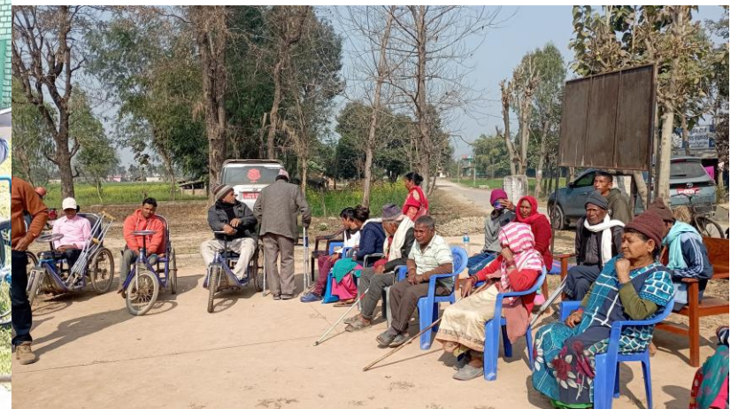
A glimpse of the city's effort toward social responsibilities