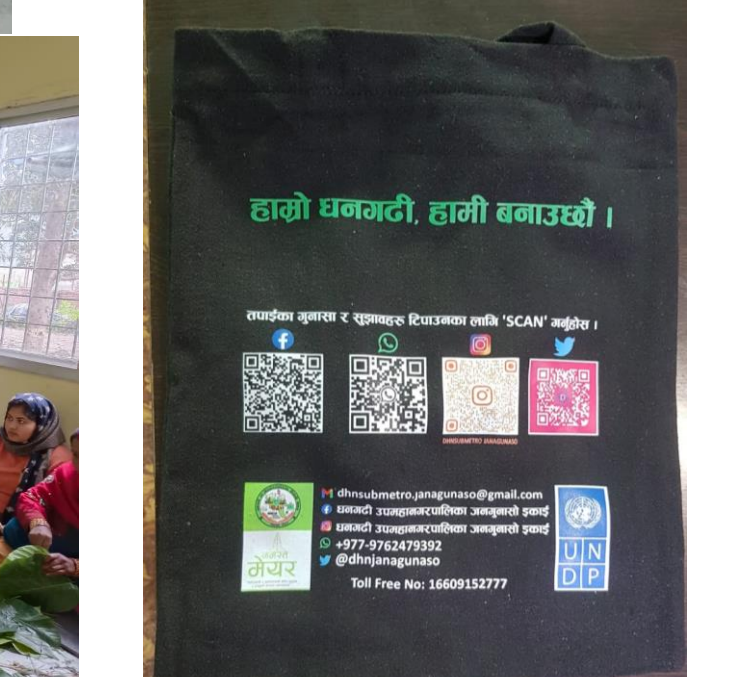
A glimpse of the city's effort toward the plastic ban and using organic and natural products.