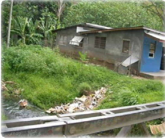
Rubbish dump in the river