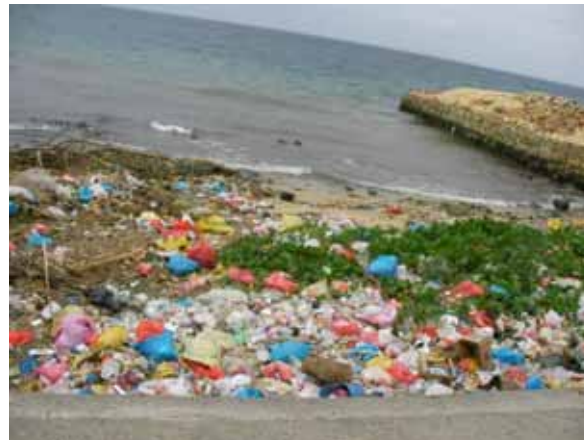
Rubbish dumped at the seashore