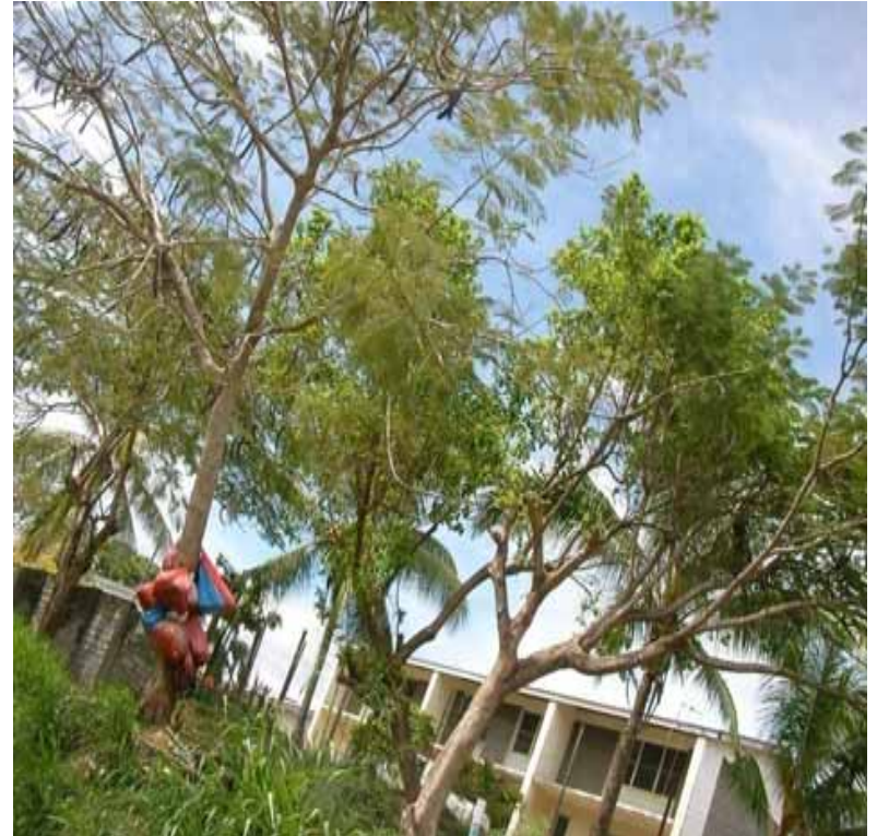
Hanging plastic bags on tree