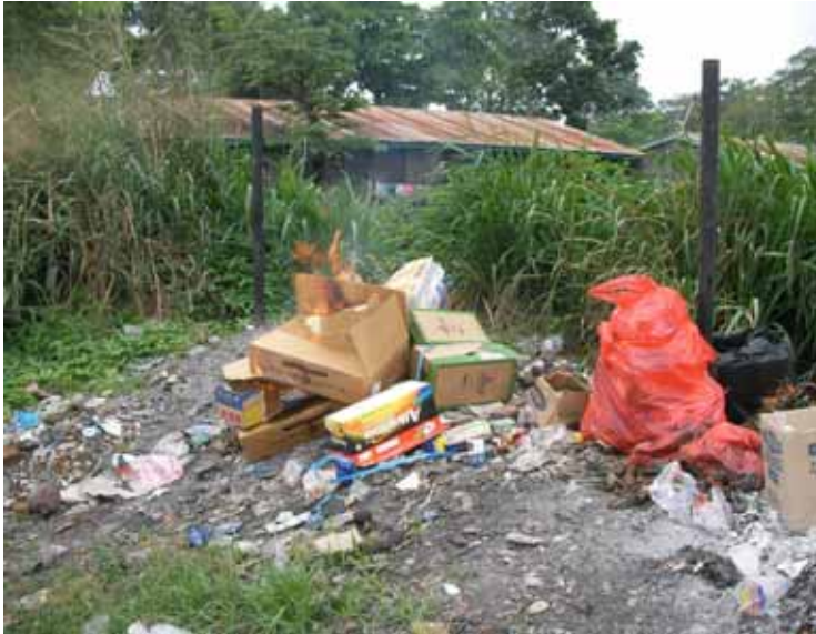
Burning of Rubbish on roadside