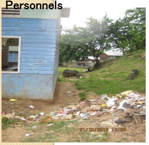
No proper management