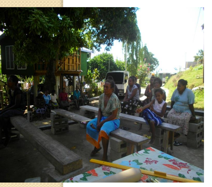
More awareness and change of attitude