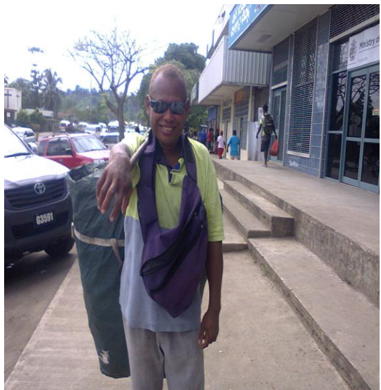
Individual Aluminum cans collections