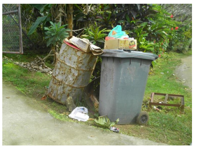
No source separation