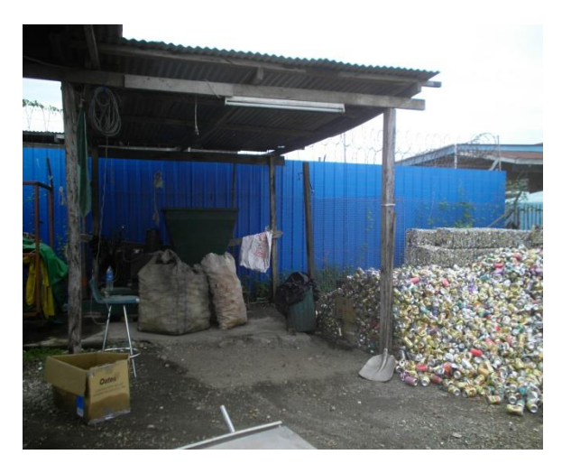
Lack of promotion of recycling initiatives