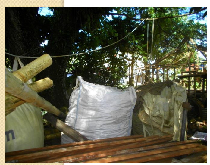
Lack of Recycling Facility for recyclables