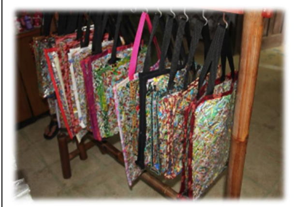
PRODUCT OF WASTE BANK

Broadening of Citizen's Awareness through forming Environment Cadres