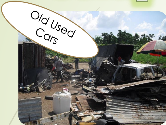
Old Used Cars