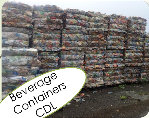
Beverage Containers CDL