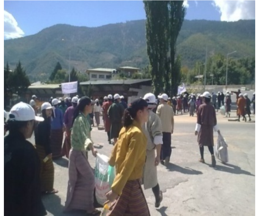
Students and public carrying out cleaning campaigns