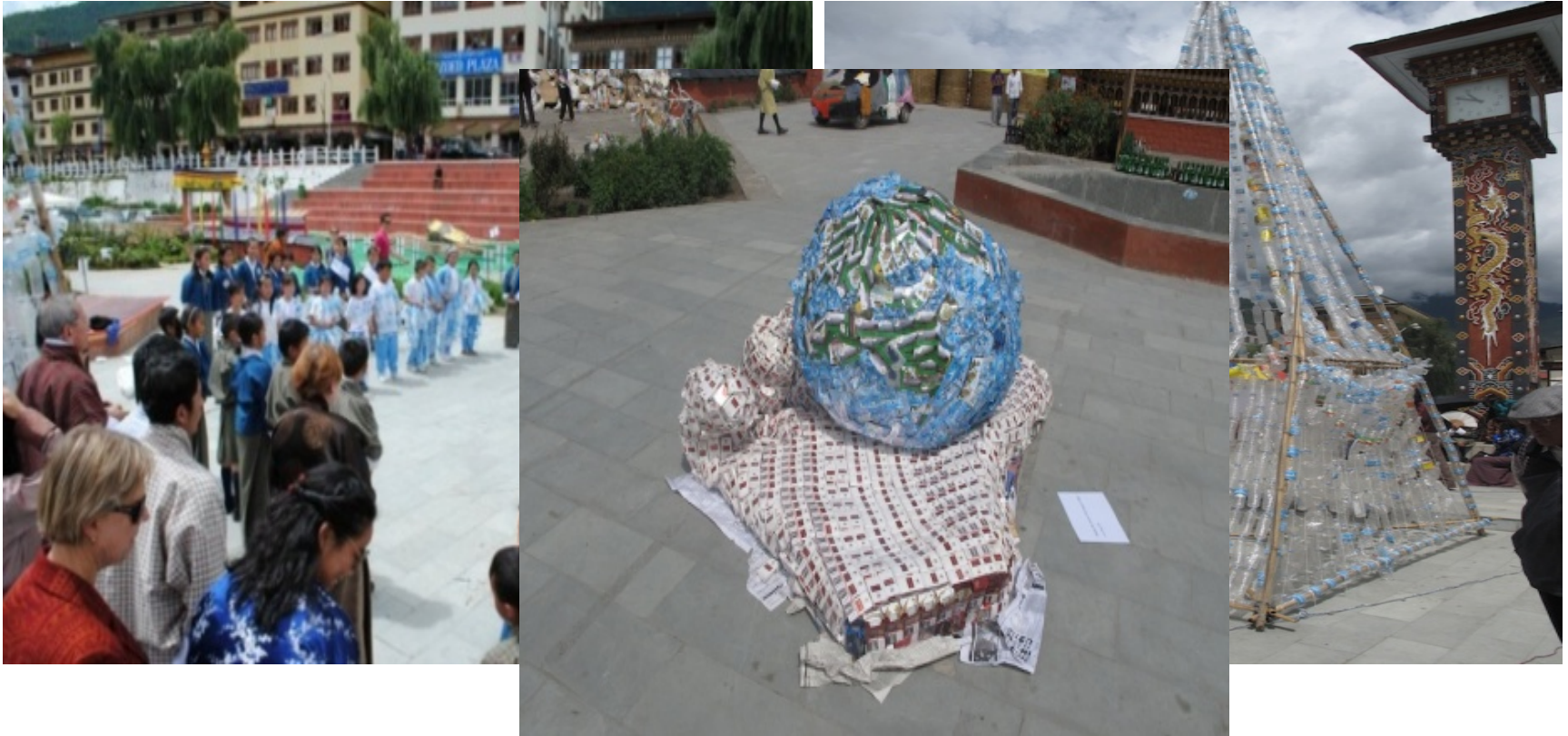
Art Exhibition on Waste Management