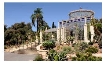
Adelaide Botanic Gardens

Take a stroll through the stunning Adelaide Botanic Gardens, visit Mt Lofty or venture further afield and visit national parks, marine parks and more. There are many options to enjoy your time in South Australia with tours of wine regions, Kangaroo Island, the Flinders Ranges and Outback. These are just a few suggestions. Visit southaustralia.com for more information.