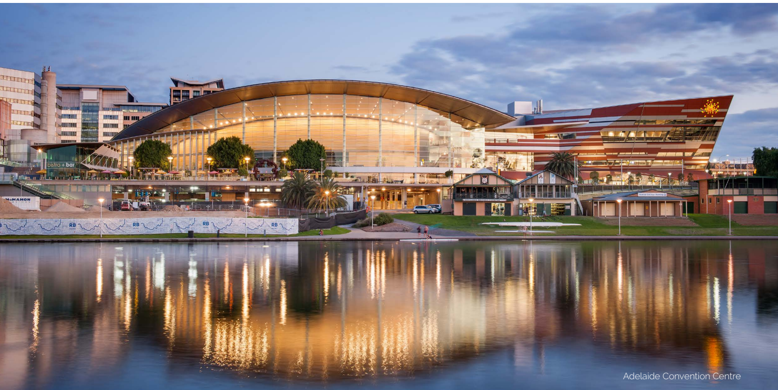
Adelaide Convention Centre

2-4 November 2016 Adelaide Convention Centre • Adelaide South Australia