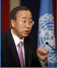
Secretary General Ban Ki-Moon