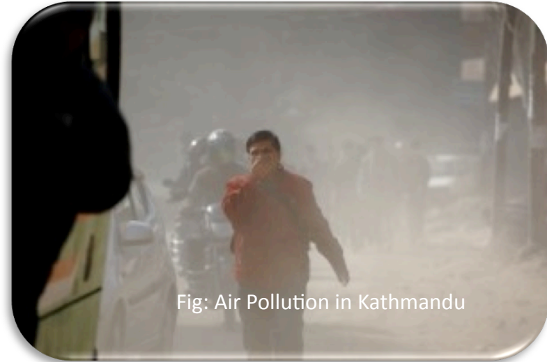
Fig: Air Pollution in Kathmandu