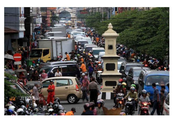
Figure 2. The rapid growth of private vehicle cause congestion