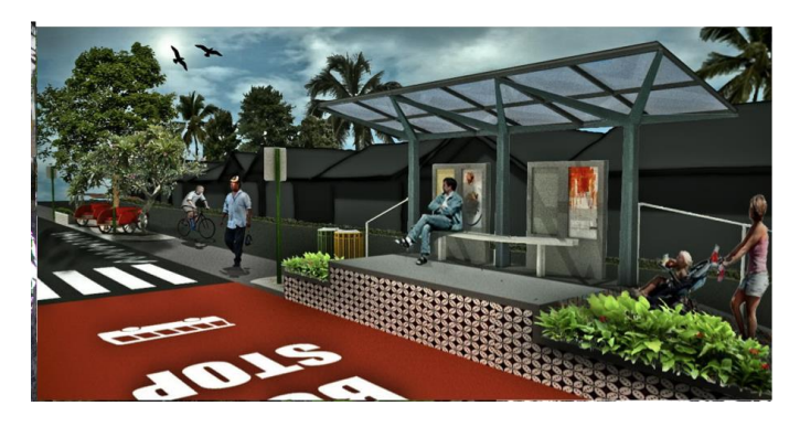
Figure 6 The Detail engineering Design (DED) of bus stop of Batik Solo Trans, has been facilitated with disabled facilities, plant in pot, and integrated with other mode

Parking policies in Surakarta City enforce parking by zoning system. Parking zone divided into five zones, ranging from the highest is zone A, B, C, D, and E. The parking zone system will regulated in Mayor Regulations (PERWALI) about Parking Zone. Due to local regulation mechanism must use the Mayor Regulation (PERWALI), the parking zone that applied in Surakarta City is only zone C, D, and E. Different zones will determine the parking rates.