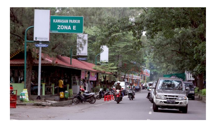
Figure 7 Signage of parking zone at culinary park Manahan