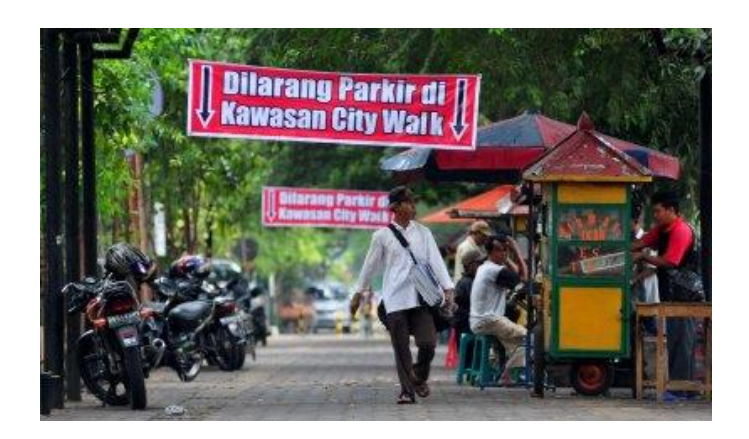
Figure 3 City Walk in Slamet Riyadi Street that should be used to facilitate pedestrian is still used as a vehicle parking and street vendor selling