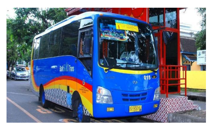
Figure 4 Batik Solo Trans