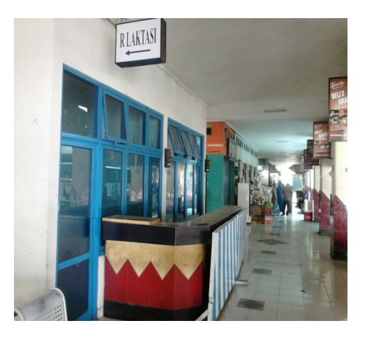
Figure 7. The breastfeeding room at Giwangan bus station

order facilitate mothers who want to breastfeed during traveling, the city of Yogyakarta has completed several bus stations with s afe and comfortable breastfeeding room.