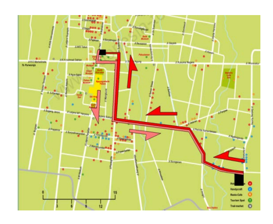
Figure 3. Map of special line for cyclist at Yogyakarta