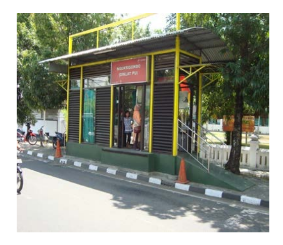
Figure 5. Bus shelter at Jl. Ngeksigondo, Yogyakarta

4. Integrated public parking area and bus shelter