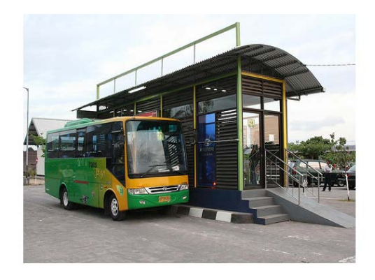
Figure 6. Integrated public parking area and bus shelter

4. Integrated public parking area and bus shelter