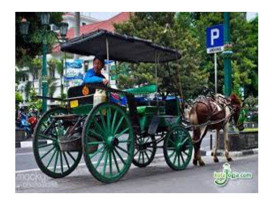
Figure 2. Andong, one of traditional transportations at Yogyakarta