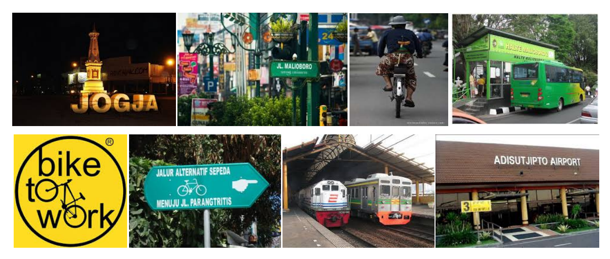
Reported by Mr. Haryadi Suyuti The Mayor of Yogyakarta, Indonesia

Yogyakarta is geographically located almost equidistant from Indonesia's two most important international gateways, about 600 km from Jakarta and 1000 km from Bali. Yogyakarta also has transport connections by bus, train or plane to the rest of Java, Sumatra, Bali and Lombok. Yogyakarta's Adisucipto Airport is in the process of changing its status in order to receive not only domestics' flights from Bali and Jakarta, but also direct charter and scheduled flights from other countries.