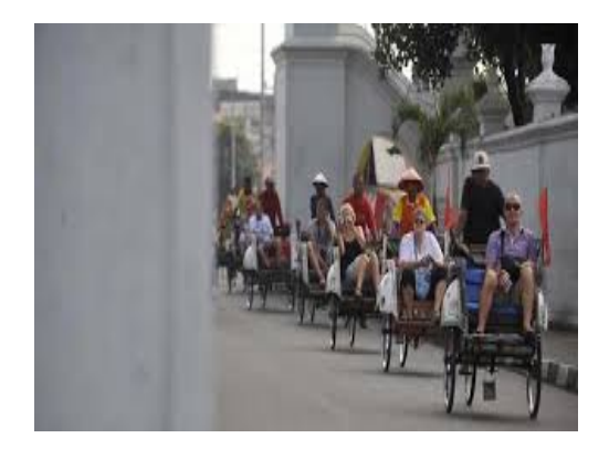
Figure 1. Pedicab, one of traditional transportations at Yogyakarta