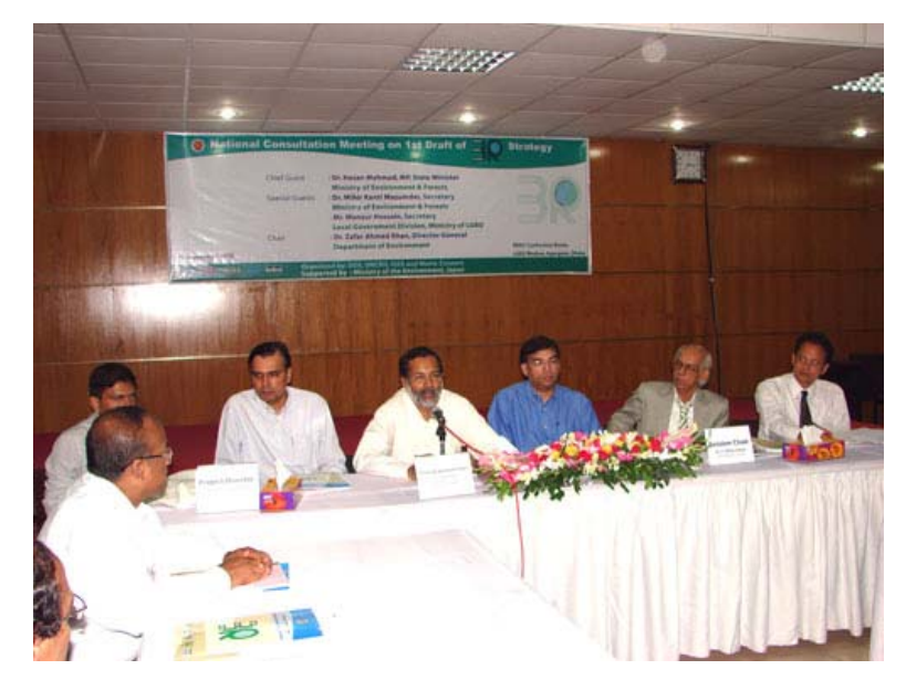
September 10, 2009 National Consultation Meeting