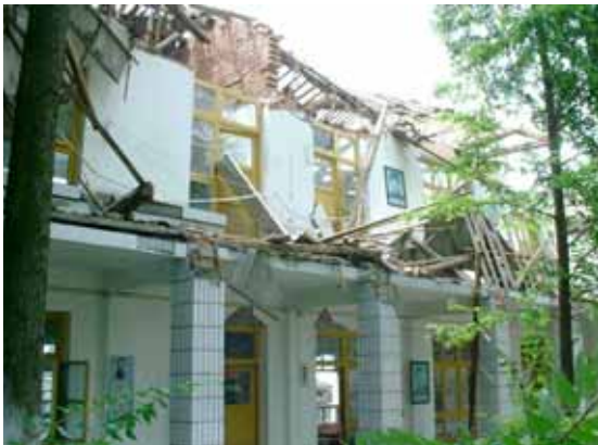
Zhundao junior high school in Zhundao town of Mianzhu City (inside broken)

In the Sichuan Great Earthquake, collapsed school buildings and resultant death and injury of school children were noticeable. This is because the earthquake occurred during school hours. Like the Great Pakistan Earthquake in October 2005, wreckage of walls, floor panes and bricks caused damage. Meanwhile, the following two photographs were taken in the research by UNCRD on June 11, 2008, less than a month since the earthquake occurred.