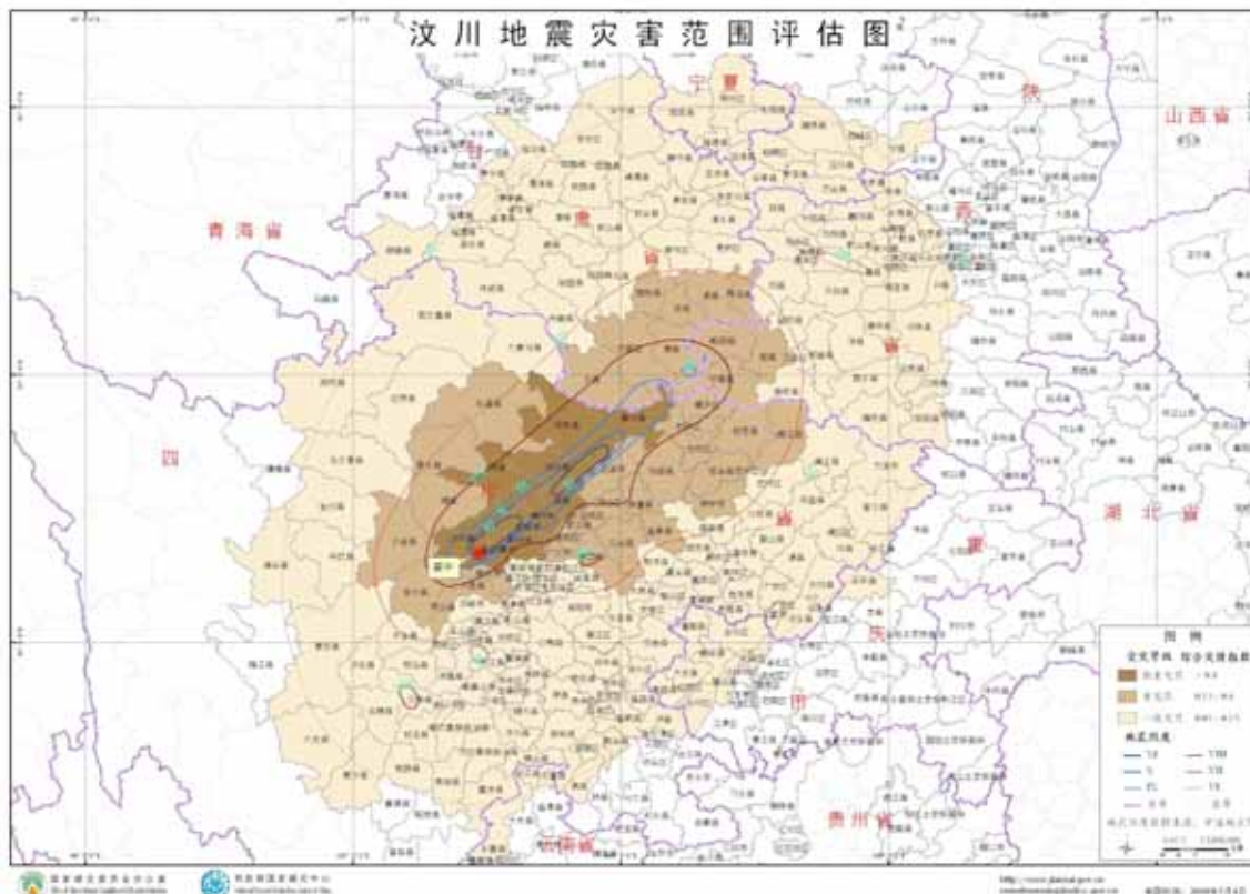
Figure 1: Areas affected by Sichuan Great Earthquake