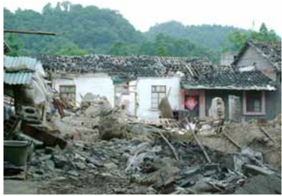
Site of collapsed town office (already removed)