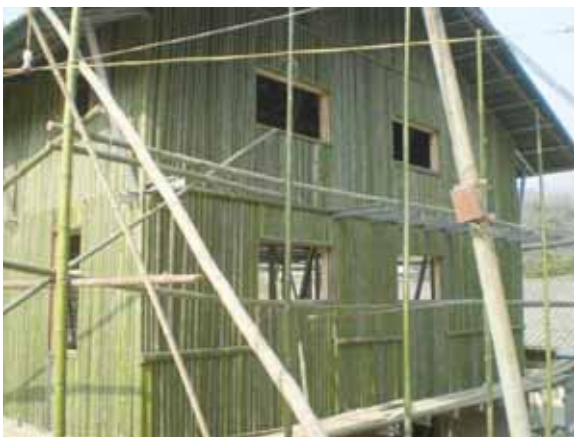
Housing reconstruction using bamboo by a Taiwanese architect (Beichuan County, December 24, 2008)