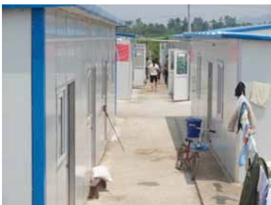
Large temporary housing complex in a suburb of Mianzhu City (Right: signboard showing the arrangement plan of the complex )