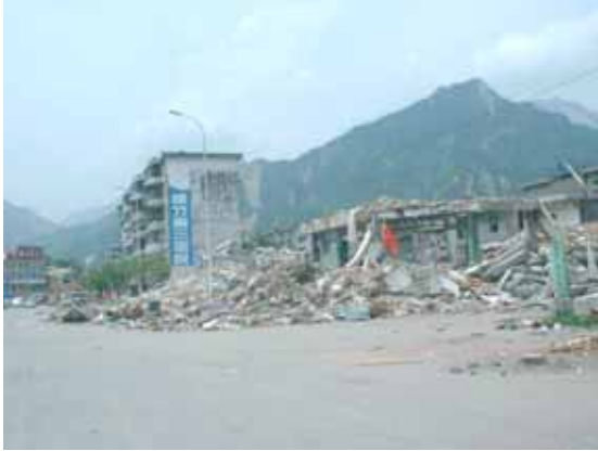
City center and mountain (Sloping failure)