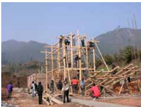
Traditional wooden house under reconstruction (in December 2008)

Collapse of houses was the major cause for human and property damage in the Great Sichuan Earthquake. Nevertheless, inhabitants did not have concrete knowledge on quake resistance of brick-built houses under construction, although they thought the houses had quake resistance “improved compared to before.” In a village of Beicuan County we visited, some people were building wooden houses in housing reconstruction due to move after the quake, because wooden houses they had lived before the quake were undamaged. As a result of the hearing survey of inhabitant families, they had preferred brick-built houses due to modernity and ease of procurement, but eventually chose traditional wooden houses, which are reparable, with a view to leave their house to their children, taking into account quake residence.