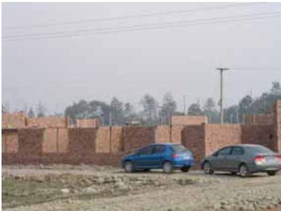
Brick-built housing complex (December 7, 2008)