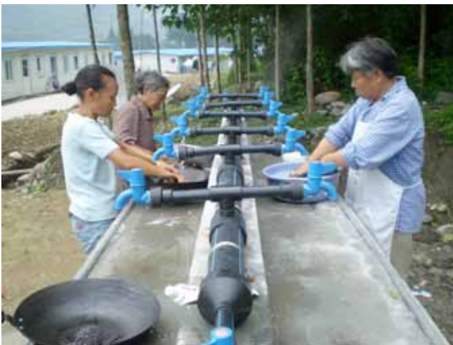
Communal water place (Dujiangyan City, August, 13, 2008)