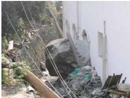
House destroyed by massive stone due to landslide (December 8, 2008)