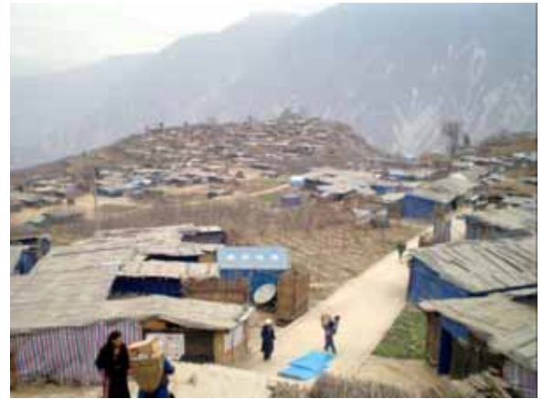
Area where support, including temporary houses, has not been reached.

(Both in Wenchuan County, on December 22, 2008)