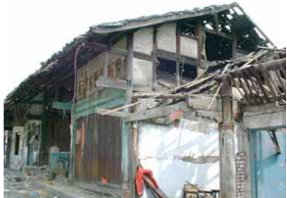
Road to Zhundao junior high school