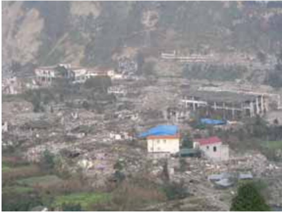
Yingxiu Town of Wenchuan County