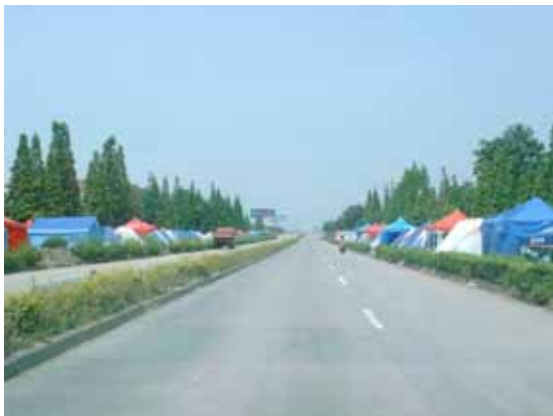
On the street from the center of Mianzhu City to Hanwang Town