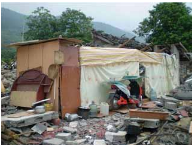
Temporary housing constructed by an owner himself/herself (Mianzhu City)