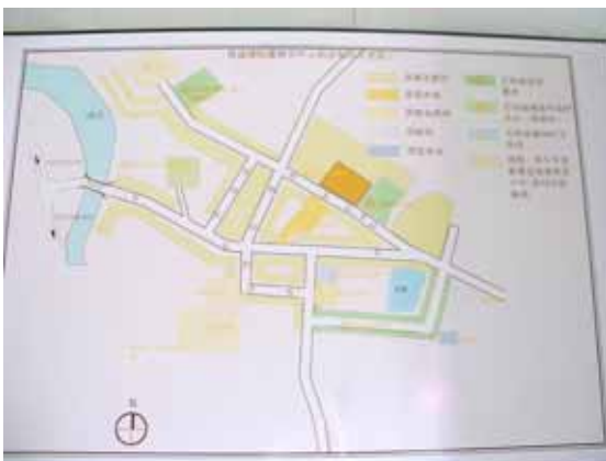
Draft plan for town recovery, showing locations of temporary shops, hospitals and schools, etc.