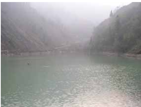
Landslide dam in the protected epicenter district of Wenchuan County