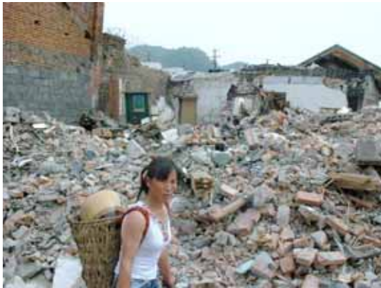
House damage in Zhundao Town of Mianzhu City (the photo was taken in June 2008)

Looking at the proportion of human damage and economic damage according to districts classified by disaster range by the national committee of experts on Wenchuan Earthquake (Table 5), most of dead and missing concentrated on the extremely seriously affected district such as Dujiangyan City and Mianzhu City, although the number of collapsed houses and economic losses in the district are smaller than in the seriously affected district.