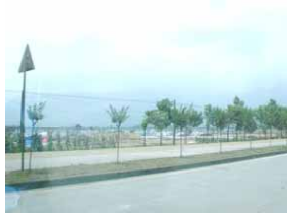
Large temporary housing complex under construction in a suburb