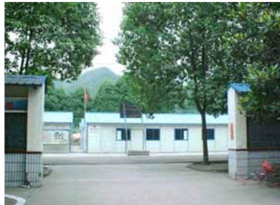
temporary elementary and junior high school in Zhundao Town (use of a ground of an elementary school)

As of June 11, 2008, a temporary elementary and junior high school had been completed in a ground of an elementary school. A junior high school in the town was unusable with the second floor almost collapsed. Although an elementary school building did not collapsed, it was condemned due to sheared columns on the first floor. In the future, the junior high school will need to be replaced, and the elementary school will need to be fixed and seismically reinforced. Meanwhile, for maintenance, reinforcement and seismic strengthening, case studies by Japan's Ministry of Education, Culture, Sports, Science and Technology and in School Earthquake Safety Initiative (SESI) by UNCRD are thought to be useful data.