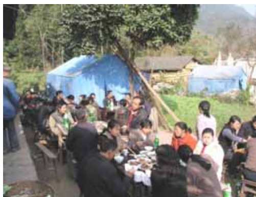
Feast after the traditional custom (in December 2008)

The recovery plan states spreading knowledge on disaster prevention and reduction and boosting awareness of all the people about disaster prevention and reduction. In order to achieve these aims, however, people in each community themselves are required to have the will to develop a disaster prevention and reduction-conscious town. Whether a community has a view of disaster reduction has been pointed out as a point of assessing town development. Firstly, whether has the attitude of consciously introducing the viewpoint of safety into a local community taken root? Secondly, whether have partnerships between governments and citizens been built? These viewpoints are