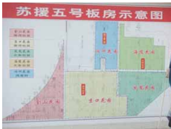
At a temporary housing in Mianzhu City