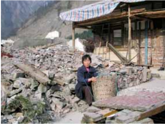
New agricultural village of Shifang City Woman living in a temporary house that she built in the rubble (December 7, 2008)