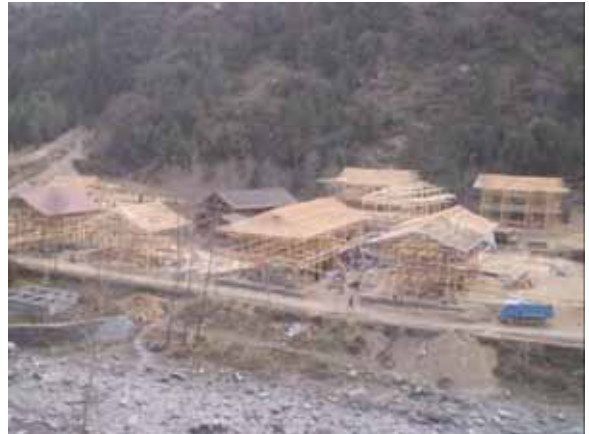
Beichuan County (December 23, 2008)