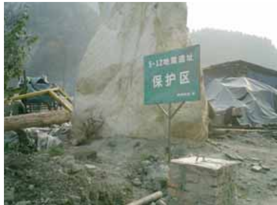
Protected epicenter district of Wenchuan County