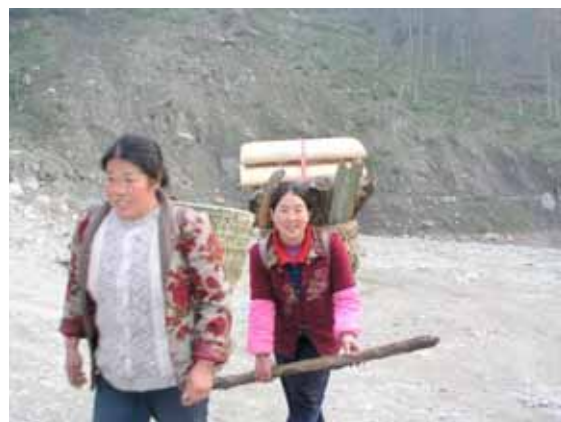
People living in the protected epicenter district of Wenchuan County

(All photos on this page taken on December 9, 2008)