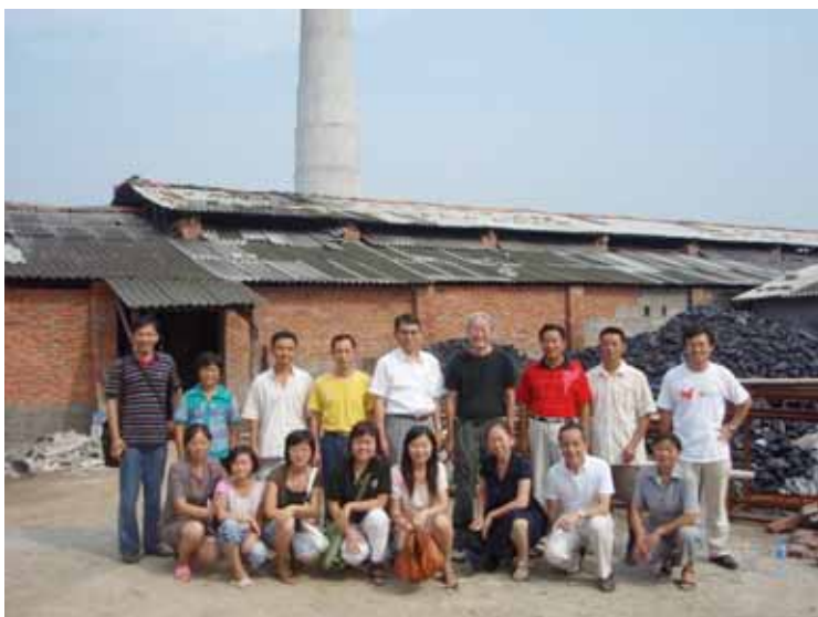
All members of the research group, and the manager and employees of a factory