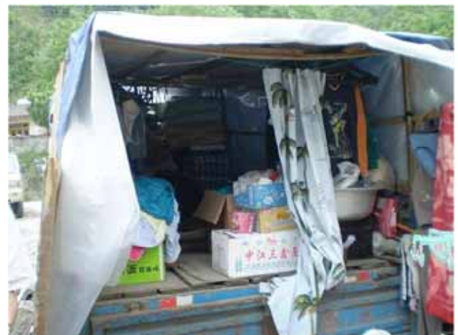
Temporary housing using a back of the car (Mianzhu City)

(All the photos on this page were taken on the period from 17 to 21, May 2008)