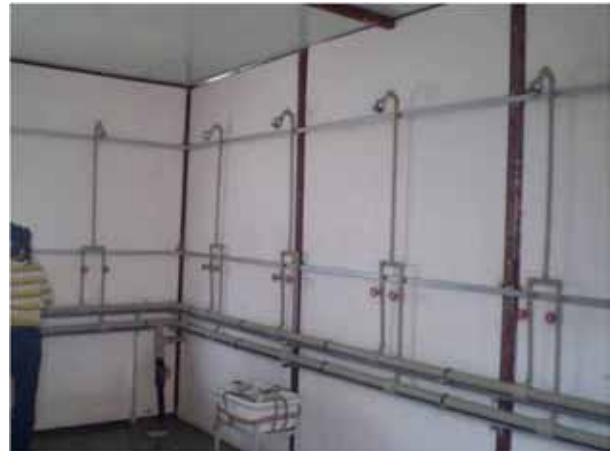
Shared shower room (Dujiangyan City, June 23, 2008)