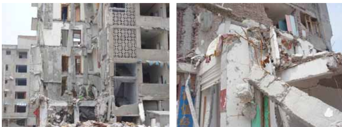
Collapsed mid- and high-rise housing complex in Dujiangyan City (in June 2008)

The photos below show a six-story housing complex in Xingfu Town near the center of Dujiangyan City. All wings were severely damaged. There was no resident in the complex as of June 12, 2008. Though causes for damage should be reviewed in details, there were such hollow floor panels hanging from walls as in Mianzhu City all over the region. Also, there were many collapsed joints between columns and beams and damaged brick walls.