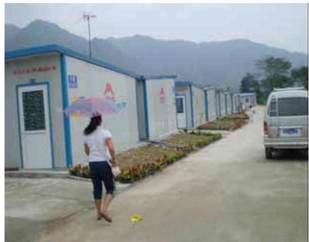
Planting flowers in flowerbeds of the temporary housing (Dujiangyan City, August, 13, 2008)