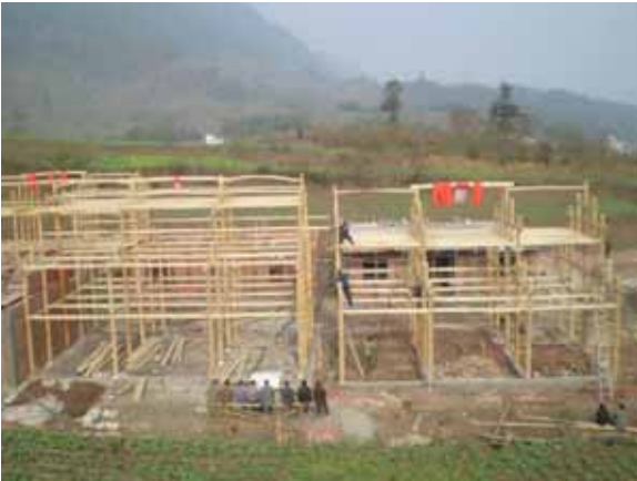
Housing reconstruction of wooden buildings (In Beichuan County, December 19, 2008)