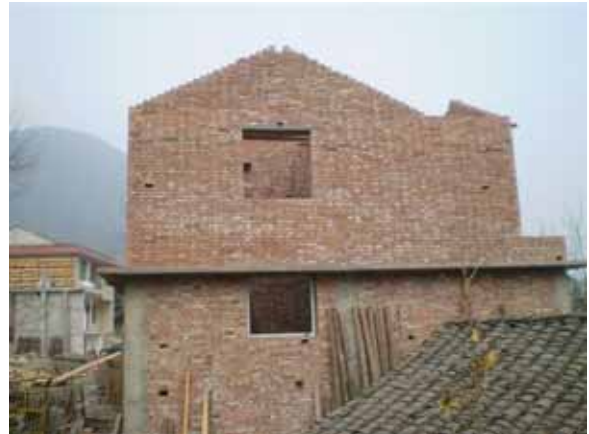
Beichuan County (December 18, 2008)