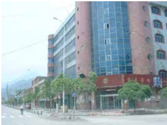
Main Street of the city center