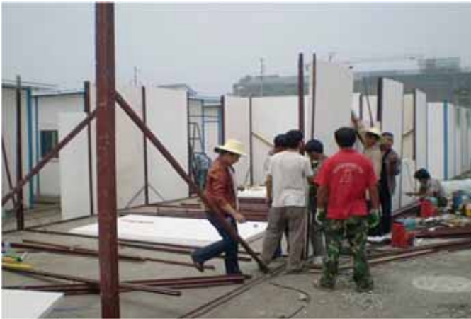
Temporary housing under construction (Dujiangyan City, June 23, 2008)