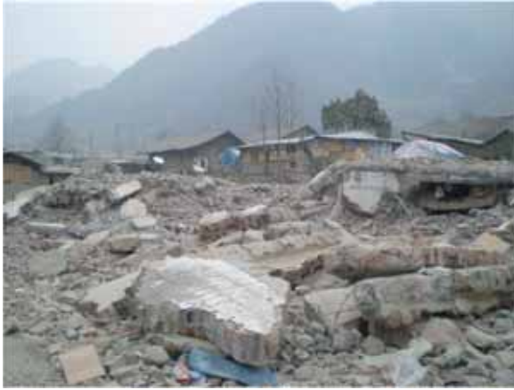
Left rubble, delay in support (In Wenchuan, December 22, 2008)