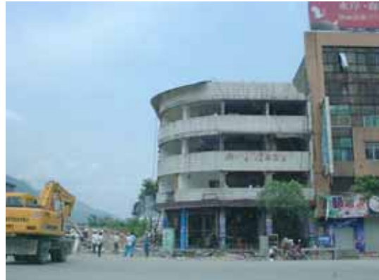
Removal of a collapsed hospital