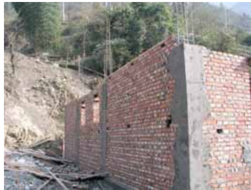
Brick-built house under reconstruction in Yingxiu Town of Wenchuan County (in December 2008)

Collapse of houses was the major cause for human and property damage in the Great Sichuan Earthquake. Nevertheless, inhabitants did not have concrete knowledge on quake resistance of brick-built houses under construction, although they thought the houses had quake resistance “improved compared to before.” In a village of Beicuan County we visited, some people were building wooden houses in housing reconstruction due to move after the quake, because wooden houses they had lived before the quake were undamaged. As a result of the hearing survey of inhabitant families, they had preferred brick-built houses due to modernity and ease of procurement, but eventually chose traditional wooden houses, which are reparable, with a view to leave their house to their children, taking into account quake residence.