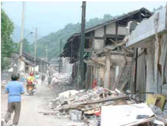
(Upper right photo: old residential district in the centre)