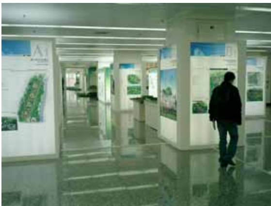
Exhibition of the disaster recovery plan held by Chengdu City (December 11, 2008)