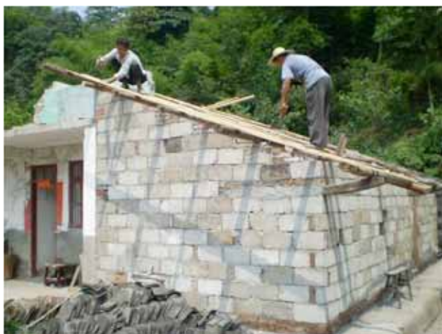
Beginning to repair houses in a rural area (In Beichuan County, Mid-August)