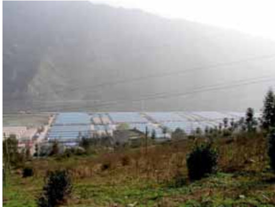
Temporary houses of Yingxiu Town of Wenchuan County

(For the idea of building an earthquake disaster museum, the shattered town has been left as it is.)