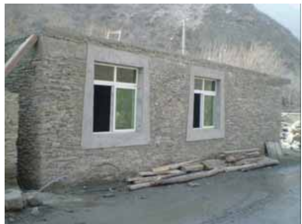
Housing reconstruction by traditional masonry construction method of the Qiang people (In Lixian County, December 25, 2008)