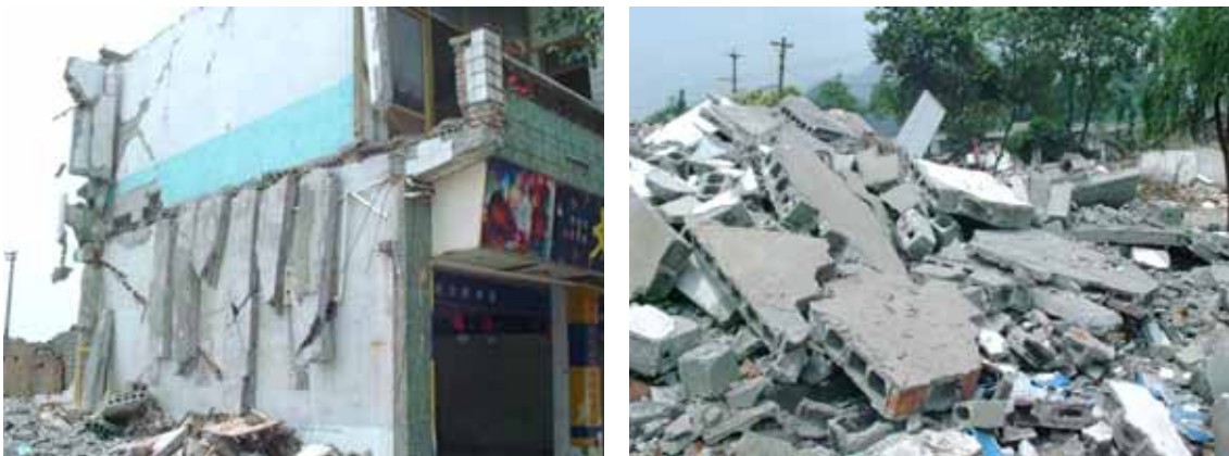
Damage on houses in the center of Zhundao Town of Mianzhu City (Right: Buildings were lost their original form in this district). The photos were taken in June.

The photos below show damage on an urban-type house (house with a shop) in the center of Zhundao Town of Mianzhu City. Houses left also had shear cracks in walls. Many houses were built of hollow concrete block or hollow floor panels on brick walls. As seen in the left photo below, we often saw joints between walls and floor panels left connected with reinforcing steel (wire), and floor panels hung from walls. This construction method using hollow floor panels was also used for school buildings.