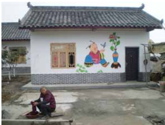
Brick-built house completed (In Zhundao Town, January 7, 2009)

(Both in Wenchuan County, on December 22, 2008)