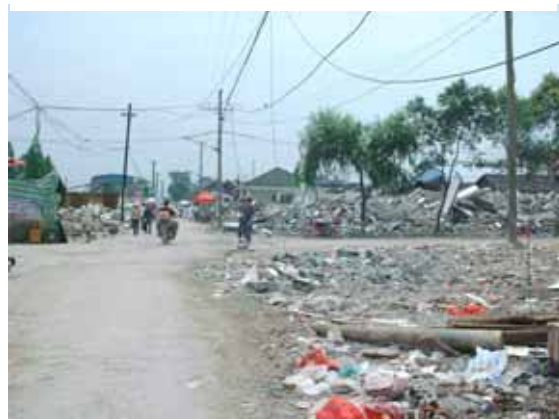
Piles of rubble of the city center, which almost totally collapsed