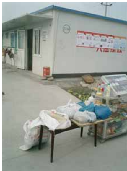
Dalian new temporary village in December 2008