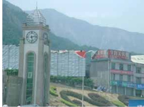
Clock of a clock tower, which stopped at 14:28