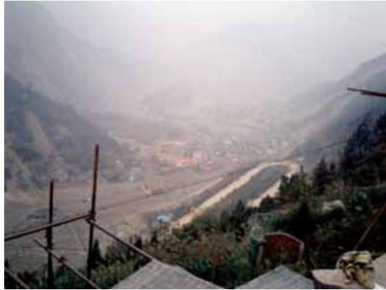
Preserved castle of Beichuan County for the idea of building an earthquake disaster museum (December 9, 2008)