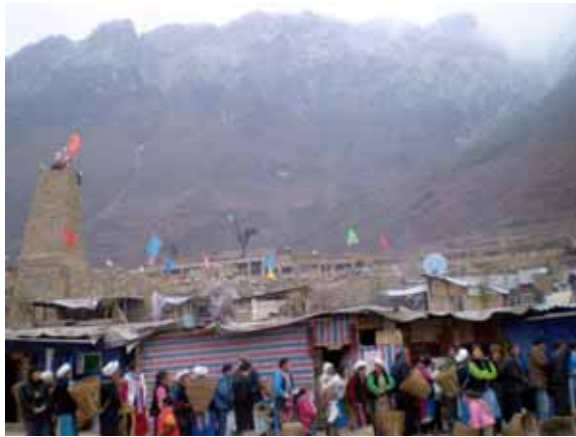
Snow piles up in mountains.