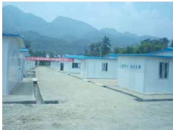
Small temporary housing complex in Anxian County (Right: some houses were vacant as of August 2008)