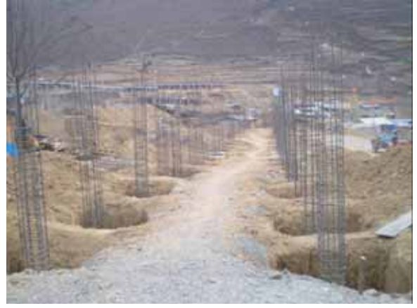
Construction halted due to cold (In Wenchuan, December 22, 2008)