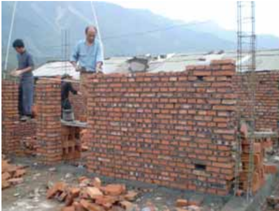
Housing reconstruction with brick and block (in Beichuan County, early October)