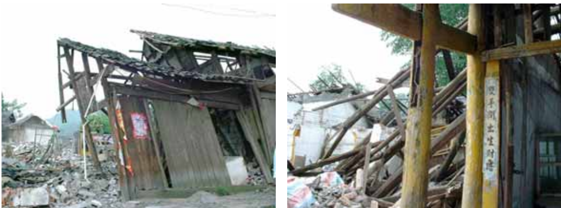
Damage on a wooden house in Zhundao Town of Mianzhu City (same for the right) Same framework method with columns and beams as in Japan. The photos were taken in June.

Sichuan province traditionally had many wooden houses, and there was such house damage as seen in the photos below. Some houses were almost undamaged as seen in the photo of Zhundao Town of Mianzhu City in 4.3 Photographs.