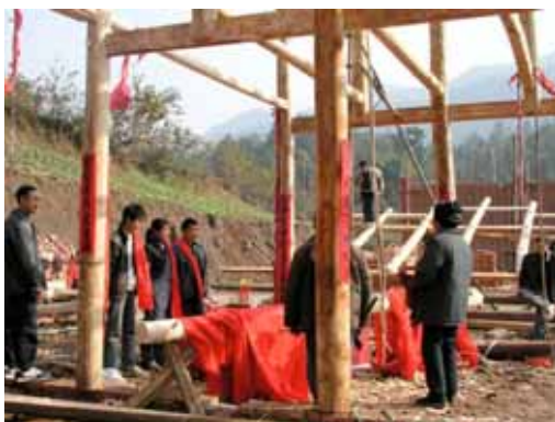
Completion ceremony of framework of a wooden house