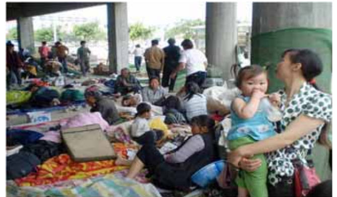
Evacuation center in Jiangyou City