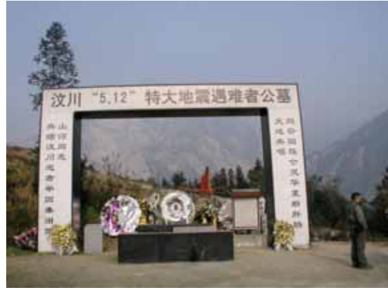
Memorial mass grave Yingxiu Town of Wenchuan County

(For the idea of building an earthquake disaster museum, the shattered town has been left as it is.)