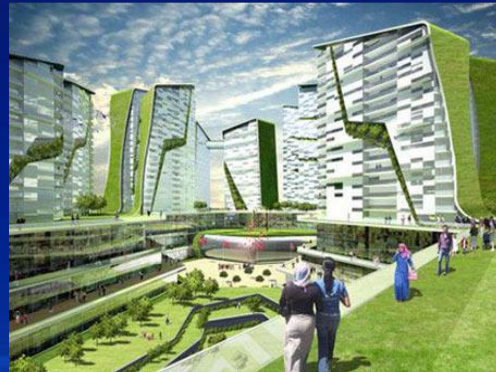
Brand II : SUC International Garden Community