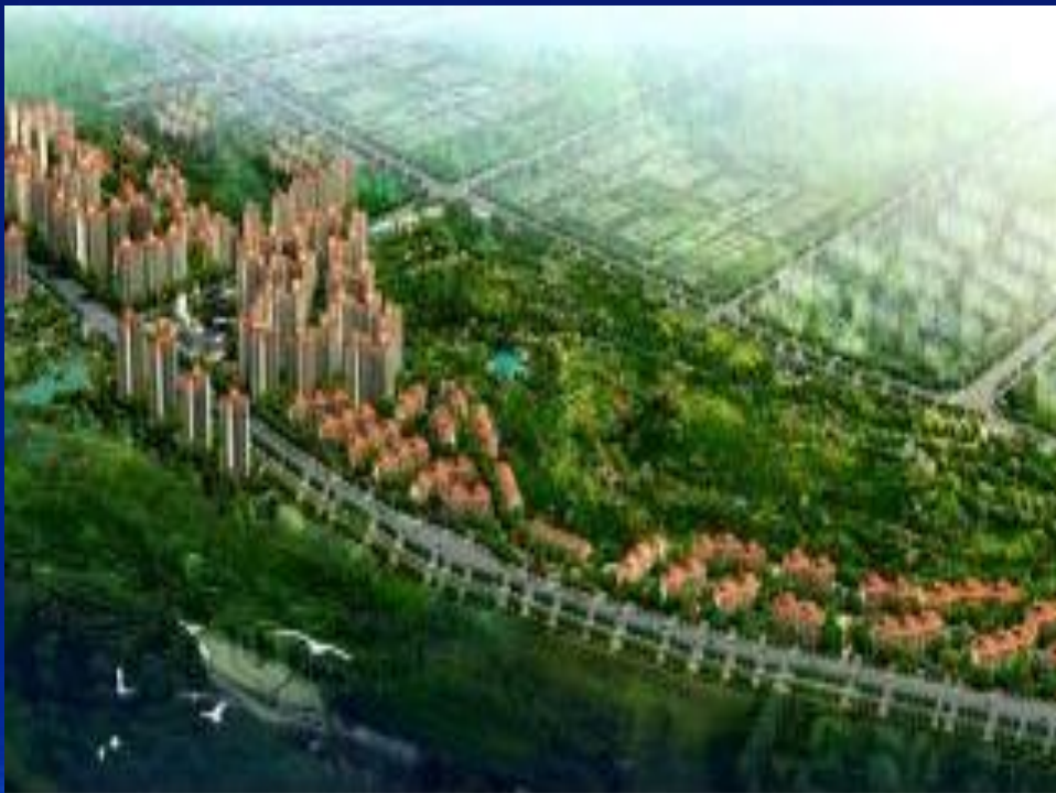
Brand I : LivCom International Garden Community