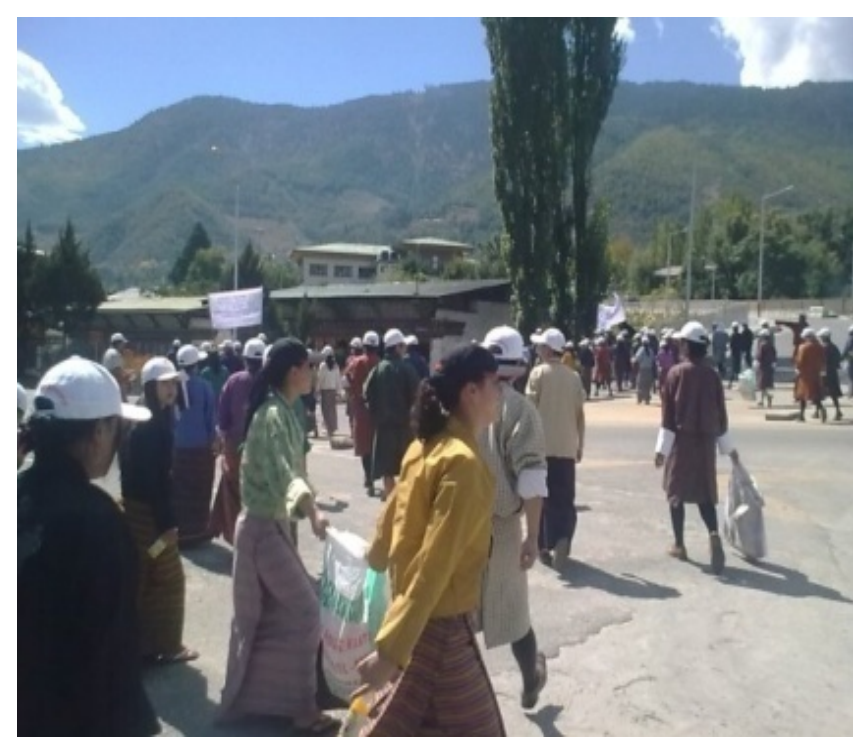
Students and public carrying out cleaning campaigns