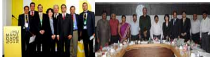
Top: Inaugural IPLA Global Forum on Moving Towards Zero Waste for Green Economy - Role of Local Authorities (LAs), Daegu, Republic of Korea, 17-18 October 2011 Left below: IPLA Side Event at Rio+20 on Zero Waste Strategies and Actions towards Sustainable Cities, Rio de Janeiro, Brazil, 19 June 2012 Right below: Multi-stakeholder consultation meeting on the Road Map for Zero Waste Ahmedabad, Ahmedabad, India, 11-12 September 2012