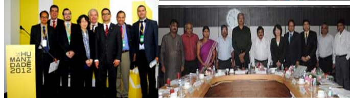
Top: Inaugural IPLA Global Forum on Moving Towards Zero Waste for Green Economy - Role of Local Authorities (LAs), Daegu, Republic of Korea, 17-18 October 2011 Left below: IPLA Side Event at Rio+20 on Zero Waste Strategies and Actions towards Sustainable Cities, Rio de Janeiro, Brazil, 19 June 2012 Right below: Multi-stakeholder consultation meeting on the Road Map for Zero Waste Ahmedabad, Ahmedabad, India, 11-12 September 2012