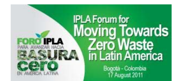
Left: Road Map for Zero Waste Ahmedabad - A Visionary Document to Guide Ahmedabad towards becoming a 'Resource Efficient and Zero Waste City' by 2031, launched by the Ahmedabad Municipal Corporation, Gujarat, India, in January 2013, with the support of UNCRD and Zero Waste SA. Right above: Inaugural IPLA Global Forum, 17-18 October 2011, Daegu, Republic of Korea. Right below: IPLA Forum for Moving Towards Zero Waste in Latin America, 17 August 2011, Bogota, Colombia.