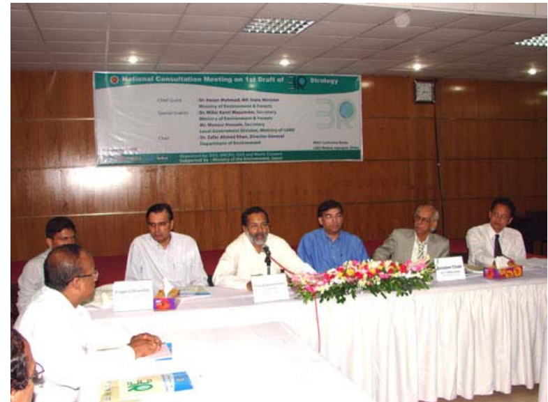
September 10, 2009 National Consultation Meeting